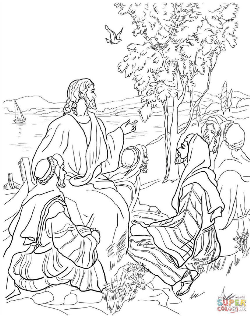
The Parable of the Mustard Seed and the Yeast Matthew 13:31-33

Each number represents a letter of the alphabet. Substitute the correct letter for the numbers to reveal the coded words.