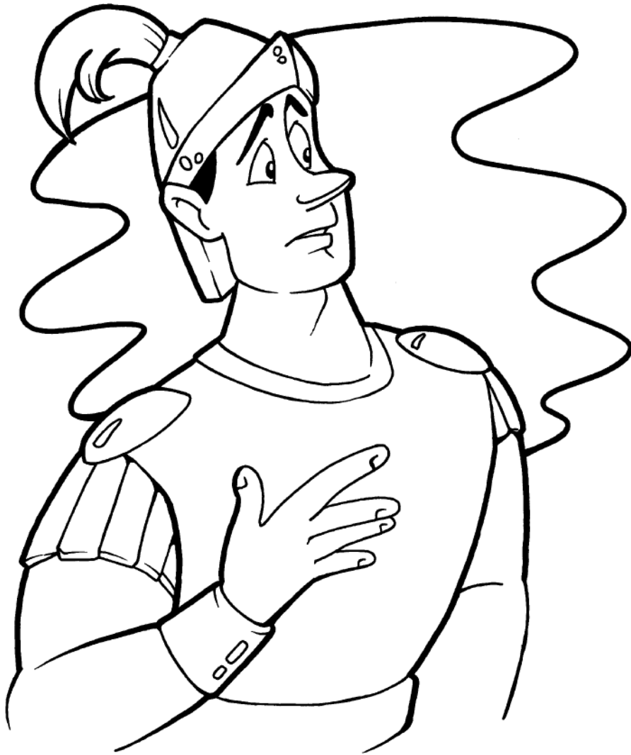
The Healing of the Centurion's Servant