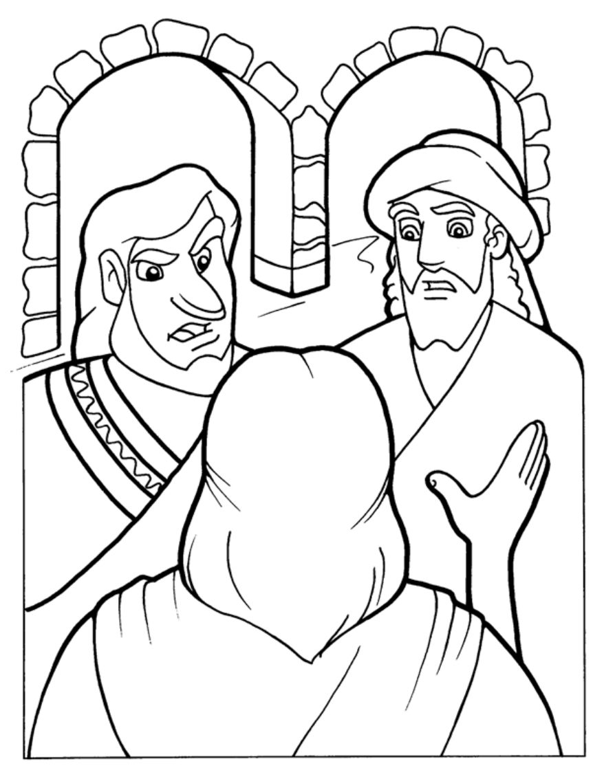
"These people honor me with their lips, but their hearts are far from me." Mark 7:6