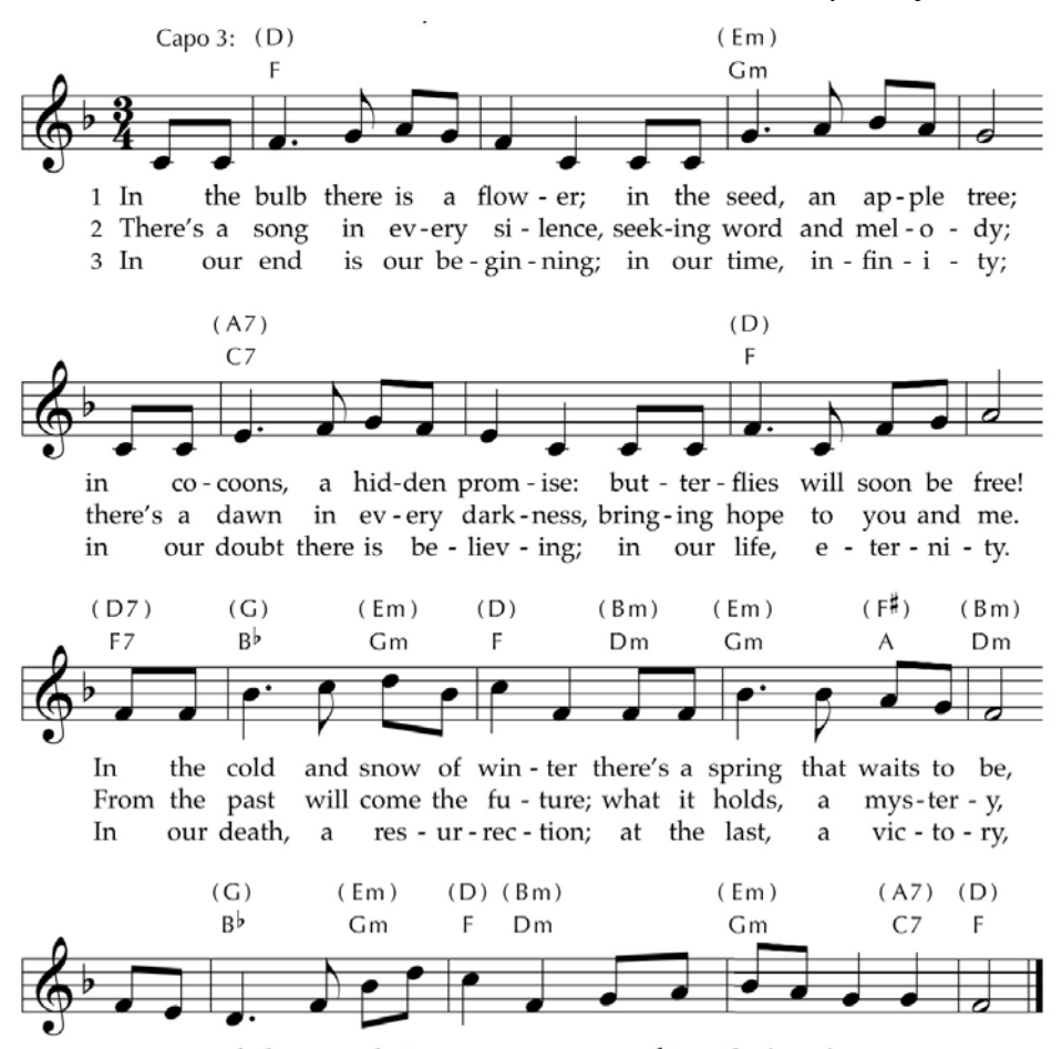
un - re-vealed un - til its sea - son, some-thing God a - lone can see.